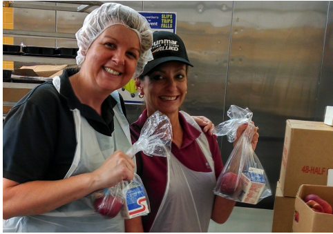
FeedMore's Community Kitchen

The community service committee had a productive and fun summer!