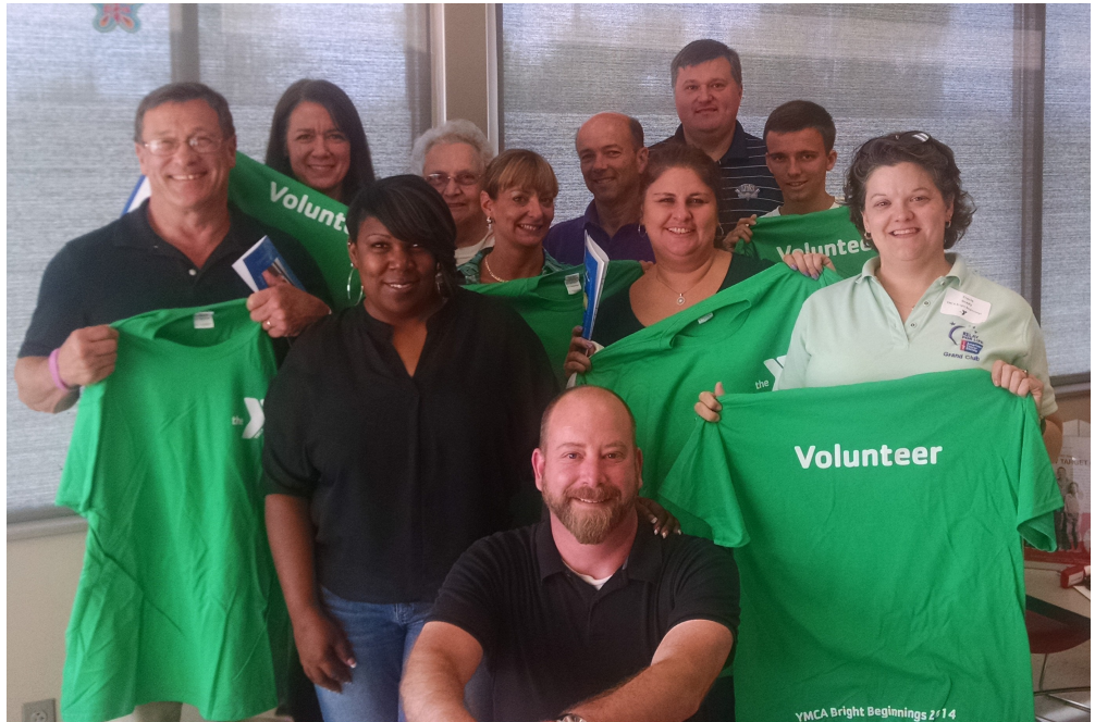
YMCA's Bright Beginnings Program